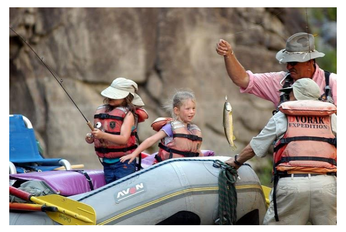
Blue Ribbon Trout Fishery 1 to 3 days