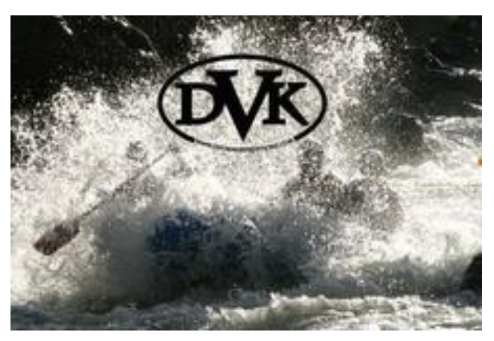
Class II to III+ Whitewater Rapids